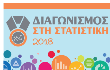
Image: Logo of the Panhellenic Statistics Competition

In 2017, the general rules and relevant information material were developed, information actions were carried out, and the interested teams of secondary education pupils attending public and private educational units of Greece were registered. Altogether, two hundred and thirty six (236) teams of pupils (144 teams of lower secondary education pupils and 92 teams of upper secondary education pupils) from eighty one (81) school units all over Greece were registered. The total number of participating lower and upper secondary education pupils was 394 and 227, respectively.