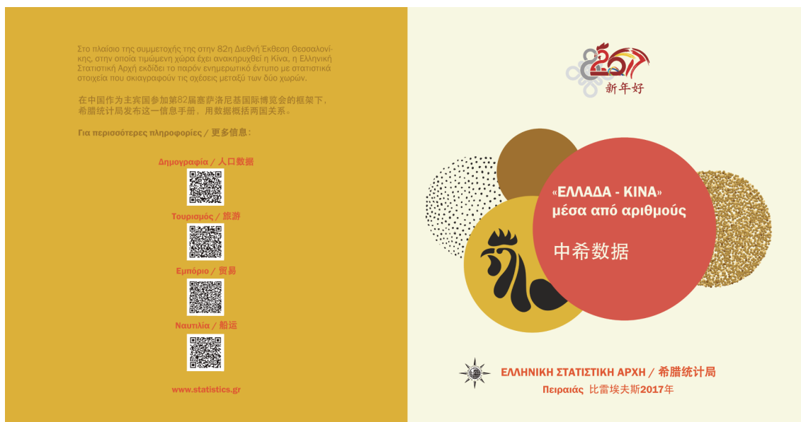
Image: The first page of the publication "GREECE – CHINA in figures".

In the framework of its participation in the 82nd TIF, in which China was proclaimed as the honoured country, ELSTAT issued, for the first time, an information leaflet entitled "GREECE – CHINA in figures". This bilingual publication (in Greek and Chinese) contains statistics that outline the relations between the two (2) countries and is available at the following link: http://www.statistics.gr/documents/20181/5346500/elstat_greece_china.pdf/3d4d8f69-a87d-4b9f-a082-bf4fb9ca4c22 .